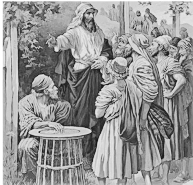
Amice, non fácio tibi iniúriam.

DAILY MASS 6:30 AM SUN - SAT Carmelite Monastery 6138 S. Gallup St. Littleton, CO 80120