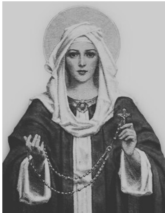
Regina Sanctíssimi Rosárii, ora pro nobis.

DAILY MASS 6:30 AM SUN - SAT Carmelite Monastery 6138 S. Gallup St. Littleton, CO 80120