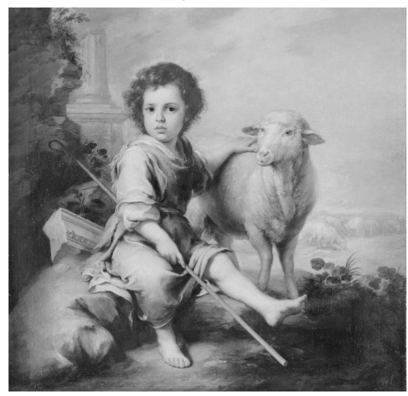
Ego sum pastor bonus: et cognósco meas, et cognóscunt me meæ.