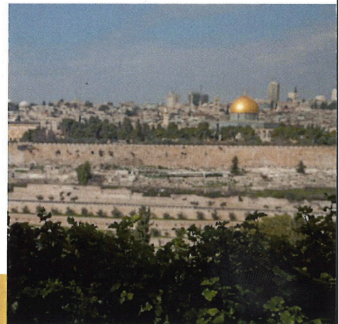
Fr. Matthew McCarthy Tour Leader

Package Price Includes: Round-trip airfare * Breakfast, and dinner * Accommodations in double occupancy luxury hotels * Transportation in a private bus * Bilingual-speaking licensed tour guide * Supporting the living stones * And Much More