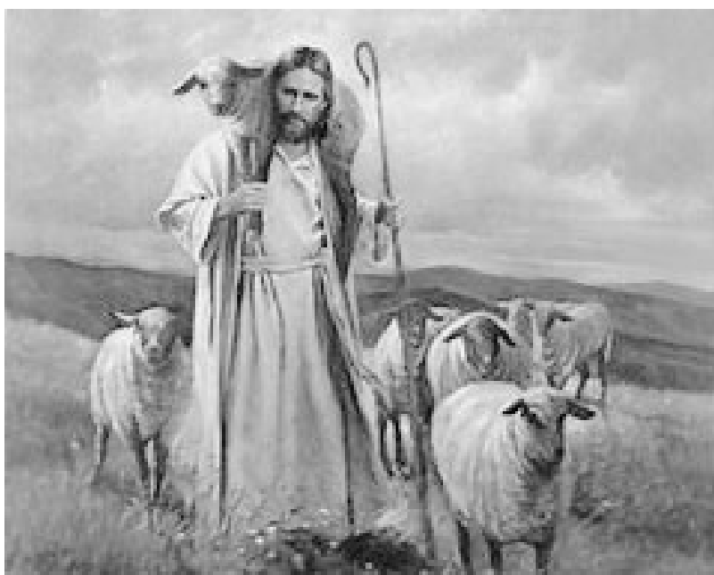
Ego sum pastor bonus: et cognosco meas, et cognoscunt me meæ.